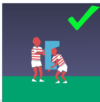
CORRECT | TACKLE SHIELD

Coaches and volunteers CAN NOT hold a tackle shield for a child. This can result in injury to the child as well as a compliance complaint with the RFL.