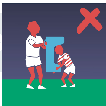
INCORRECT | TACKLE SHIELD

Under no circumstance must a coach, volunteer or parent hold a tackle shield for a child to tackle. An adult can hold the top of a tackle bag for a child to tackle, please see the diagrams below for more detail.